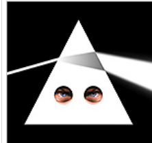
Op-Ed: Shades of Prejudice