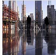
Glassmaking Is Declining in the U.S.