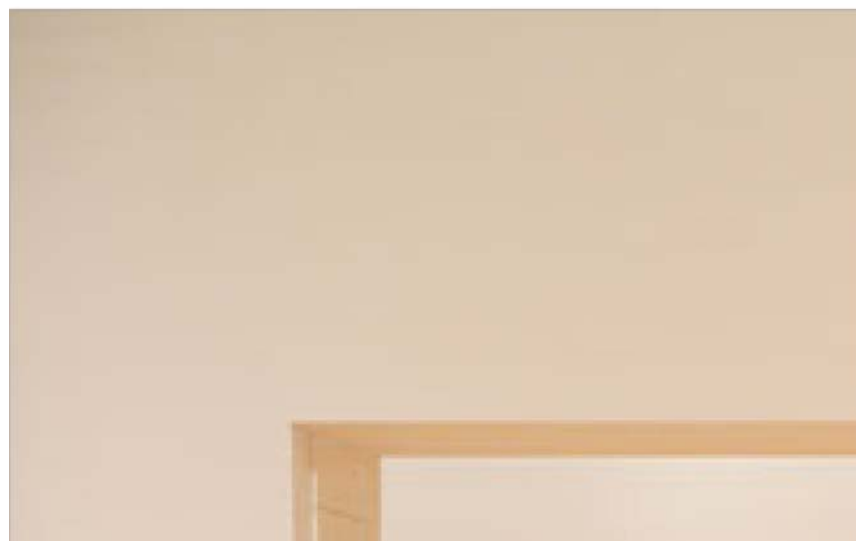
Published: January 10, 2010