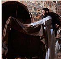
Modern-Day Pilgrims Find Interfaith Bond