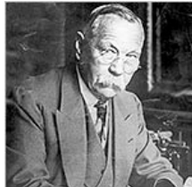
For the Heirs to Holmes, a Tangled Web